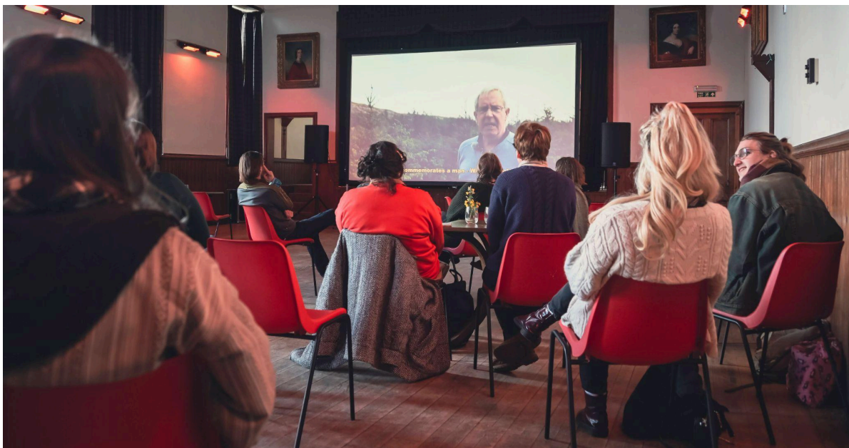
Dàn Fianais at the Skye Gathering Hall, 2022, and ATLAS' community cinema kit

Day 4: Join a Creative Carbon Scotland webinar, help load the cinema kit into a team member's car, finish some GDPR tasks, come to an ATLAS book launch to sell some books