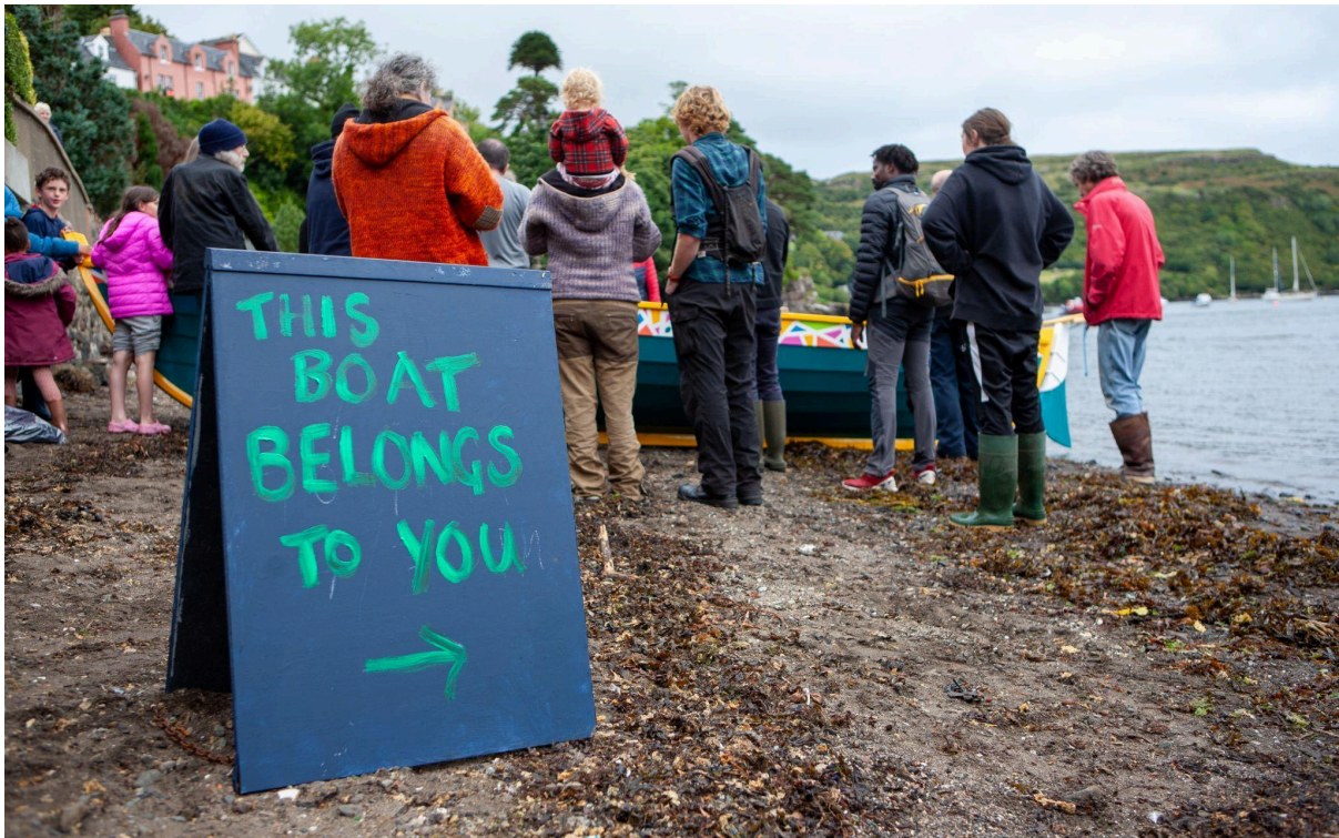
From Plockton to Portree: A boat build project, by Malcolm Mackenzie. Portree boat launch 2023.